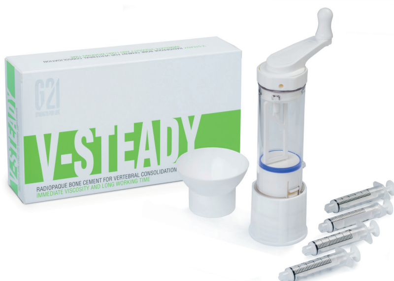
V-STEADY and PicoMix V