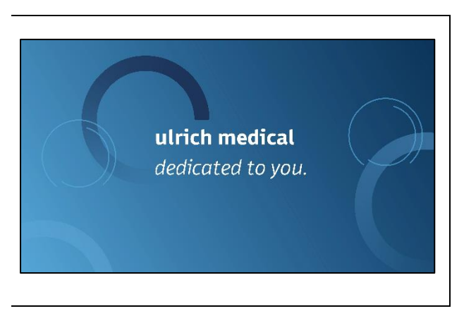
Bild 3: The corporate design of Ulrich Medical with the brand message "dedicated to you."